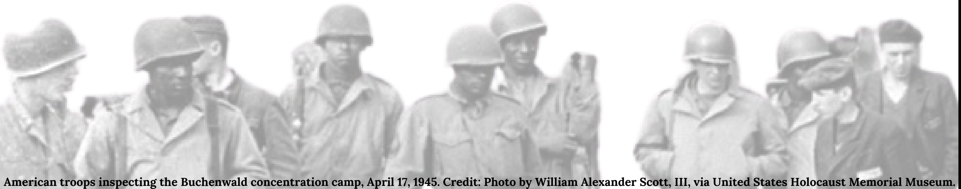
American troops inspecting the Buchenwald concentration camp, April 17, 1945.

Stockton is an Equal Opportunity Institution