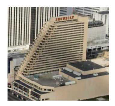
The former Showboat hotel and casino, site of the future Stockton Island Campus.

The Office of the Secretary of Higher Education has approved Stockton's petition for University Status, accepting a consultant's report that affirms Stockton has been operating as a university for several years. The Academic Issues Committee of the New Jersey President's Council will review the petition during its upcoming winter meetings, after which we hope to update our friends and neigh-