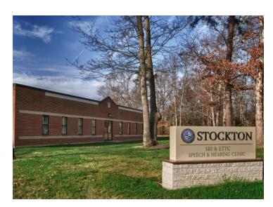
The SRI & ETTC facility located on 10 W. Jim Leeds Road in Galloway

For your custom workshops, contact the SRI&ETTC at 609-626-3850.