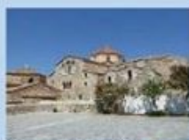
Paros - Ekatopiliani

Support the Friends of Hellenic Studies Scholarship Fund with a gift by sending your check to: Stockton University Foundation (In the memo line, please write Friends of Hellenic Studies ) 101 Vera King Farris Drive Galloway, NJ 08205 Or go to: www.stockton.edu/give and direct your gift to Friends of Hellenic Studies