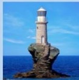
Andros – Tourlitis automated Lighthouse