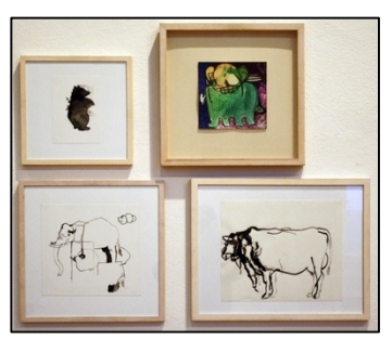
Sylvia Pasztor Top left "Tübbi" Top right "Fanti" Bottom left "Vieh" Bottom right "KUH"