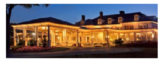
NOVEMBER 2015 VOLUME 1 ISSUE NO. 2