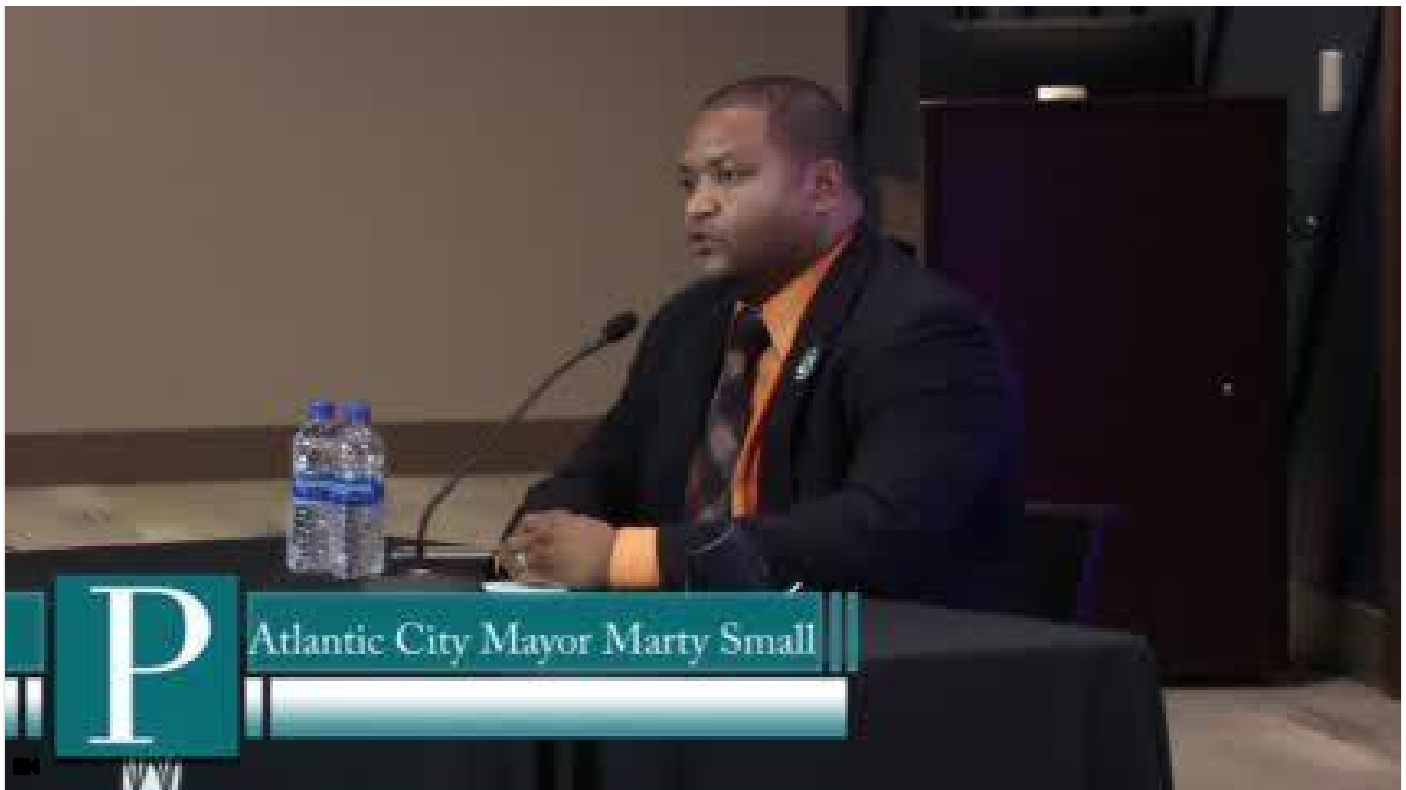
Small, Forkin verbally spar during Atlantic City mayoral debate at Stockton

GALLOWAY TOWNSHIP — A majority of adults in the state think racism and racial inequality, as well as police violence, are major problems, and that police treat people of color more harshly than white people, according to Stockton University poll results released Wednesday morning.