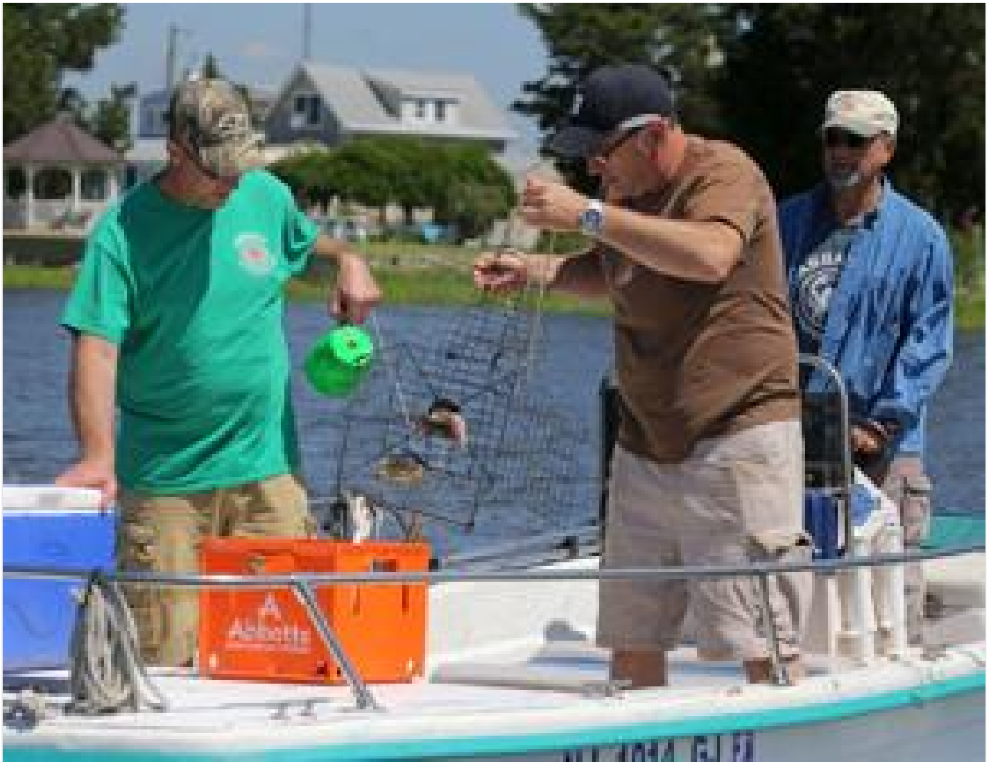
Animal rights group protesting Somers Point crabbing tournament