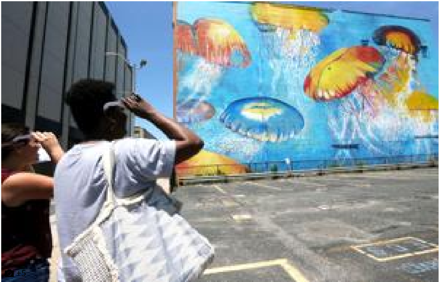
48 Blocks provides interactive experience with Atlantic City mural tour