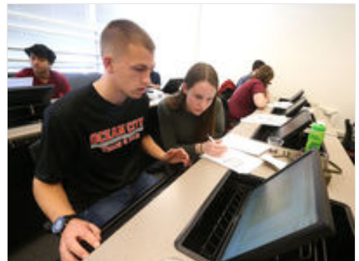
High school students crack the code at Stockton competition