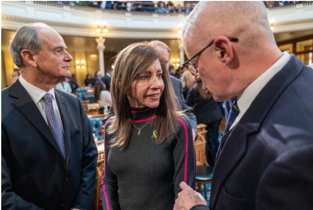
Tammy Murphy said the conversation around late-term abortions has become hijacked by “Republican fearmongering.”