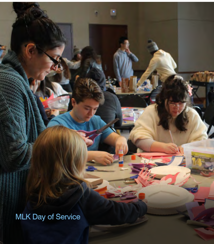
MLK Day of Service