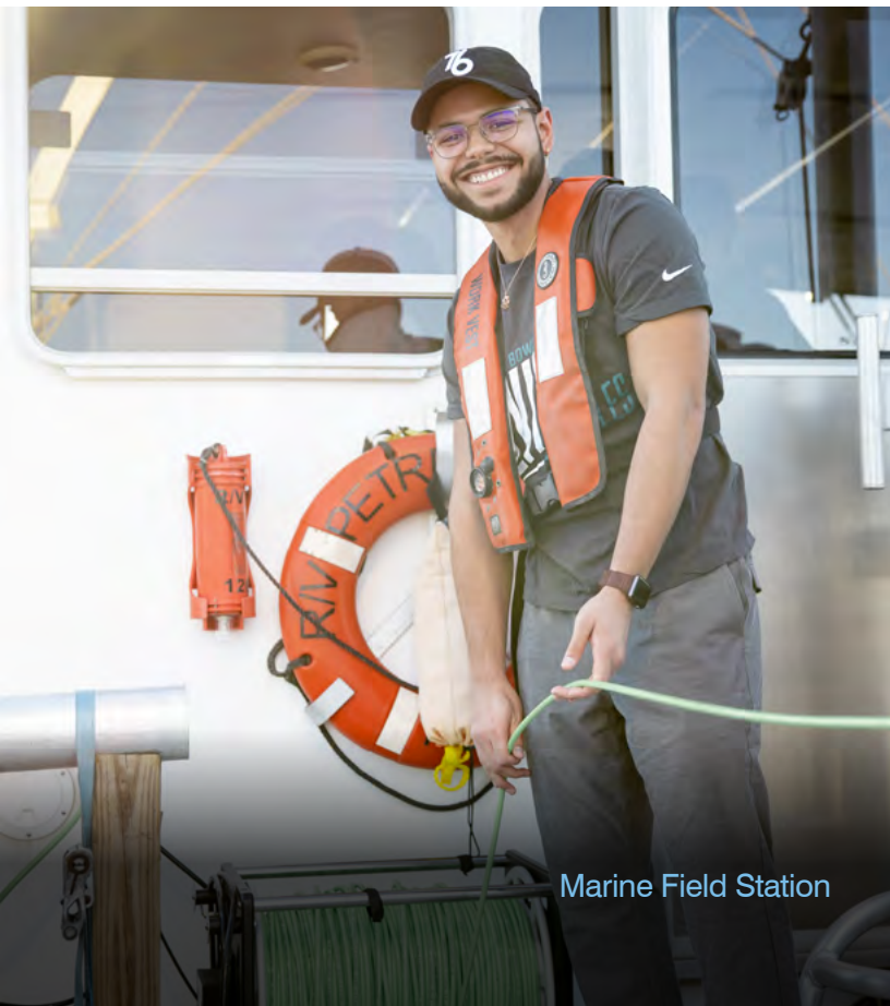
Marine Field Station