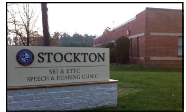
Visit the SRI & ETC at 10 Jimmie Leeds Road (near GS Parkway)

"Like" us on Facebook and get daily updates about workshops and classroom resources.