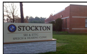
Visit the SRI & ETTC at 10 Jimmie Leeds Road (near GS Parkway)

Go to http://www.ettc.net/calendar/ for more information.