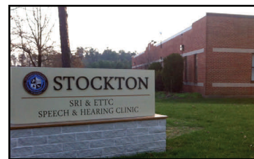
Visit the SRI & ETTTC at 10 Jimmie Leeds Road (near G5 Parkway)

Alliance for Excellent Education , the day provides an opportunity for teachers to add their voice and expertise to a conversation with tens of thousands of other educators - representing nearly 2 million students - through ongoing activities, idea sharing, and collaboration. Teachers can also win money for their schools and equipment for their students.