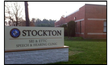
Visit the SRI & ETTC at 10 Jimmie Leeds Road (near GS Parkway)

Go to www.ettc.net/conference for details about presenting and registering to attend.