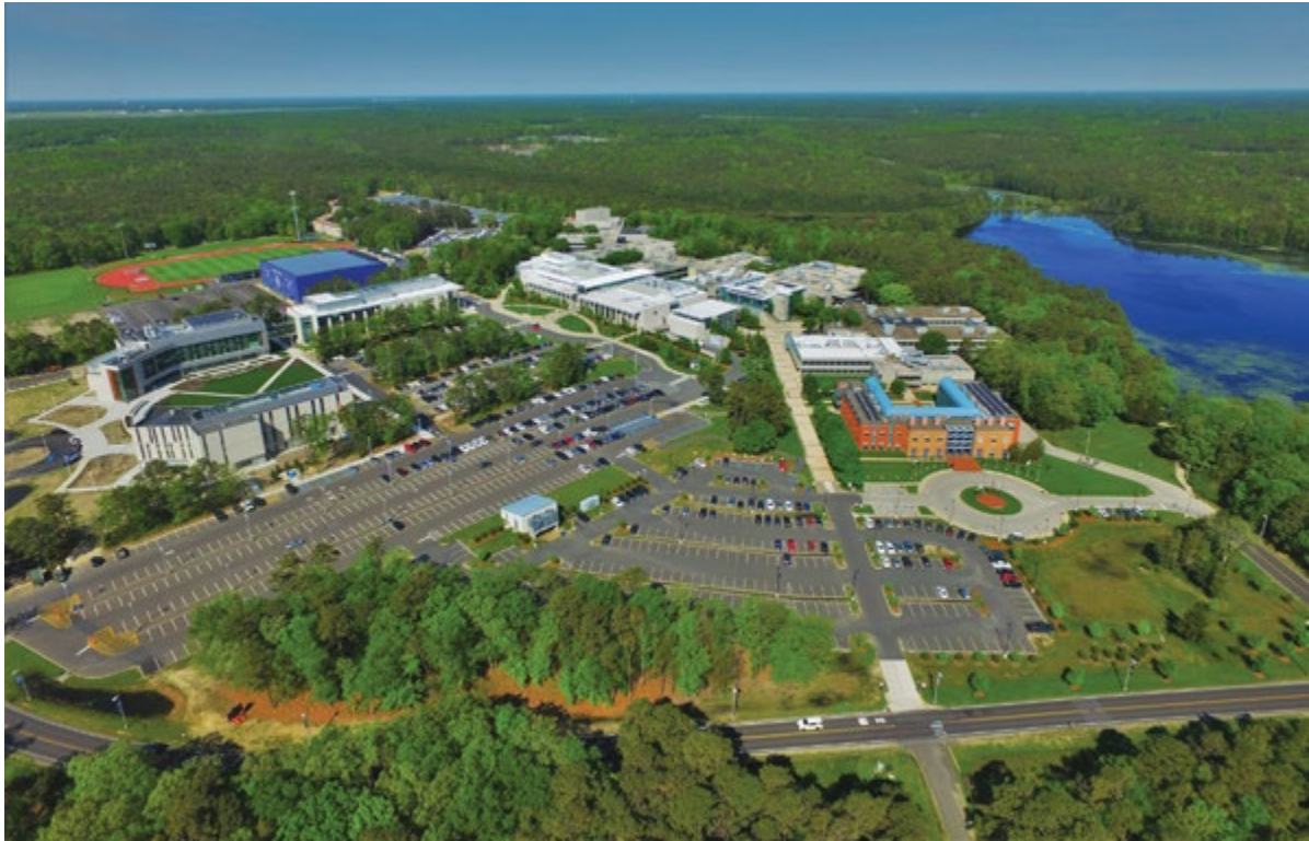
Stockton Main Campus