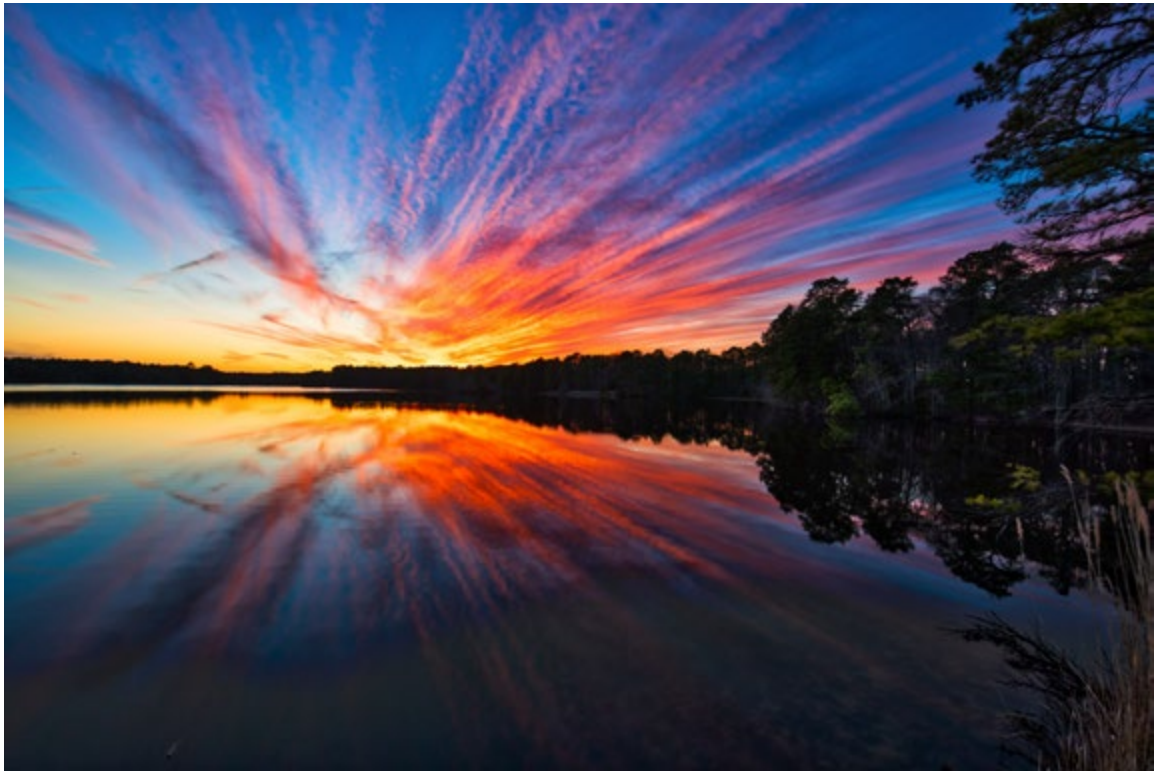
Lake Fred at Sunset