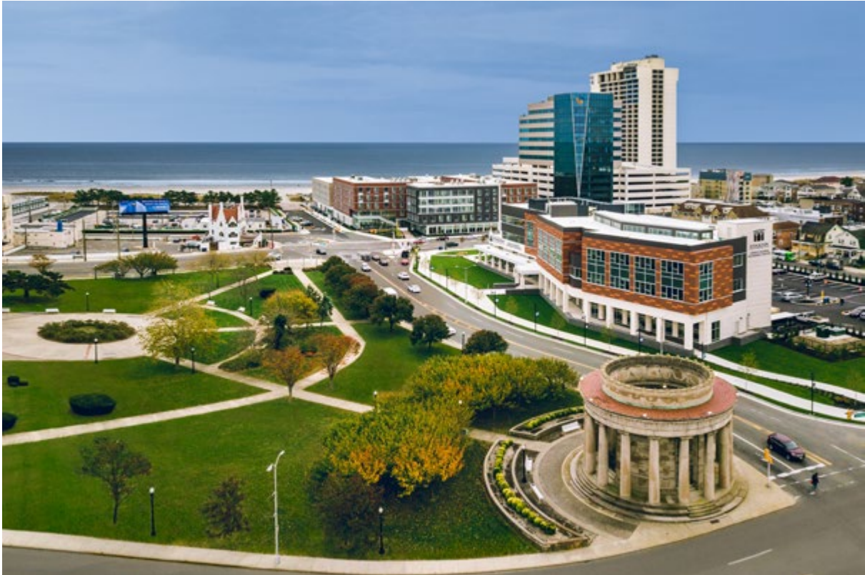
Stockton Atlantic City