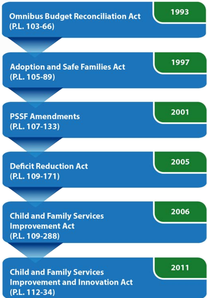
Exhibit 1: Timeline of PSSF Legislative History

Key PSSF legislation is shown in the timeline in Exhibit 1.