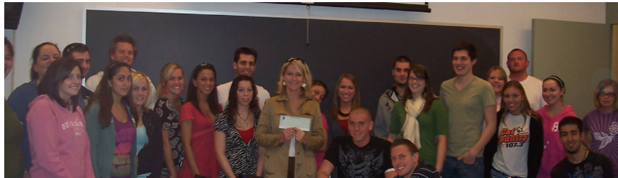
Above: Students present The Alcove, Center for Grieving Children with a $2000 check