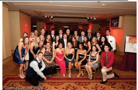
Right: HTMS students volunteer during Stockton's Scholarship Gala