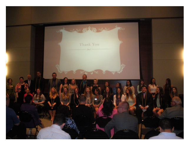
Students inducted into Eta Sigma Delta

Service activities for ESD occurred during the month of March with students volunteering in multiple events including the Community Food Bank of South Jersey, where students worked in a mobile pantry which was stationed in various locations in the area including Ventnor, Galloway, and Egg Harbor City. Even in snow and freezing temperatures, students were handing out food and helping the community. Students also had the opportunity to volunteer and participate in the New Jersey Travel Industry Association's Conference on Tourism held at The Golden Nugget in Atlantic City.