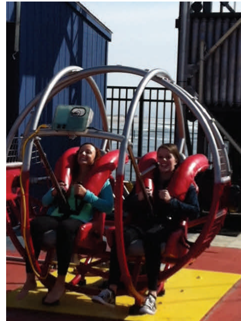
Right: While on a tour of Steel Pier, adventurous Intro to Hospitality students had the opportunity to ride the "Sling Shot", a bungee style thrill ride.