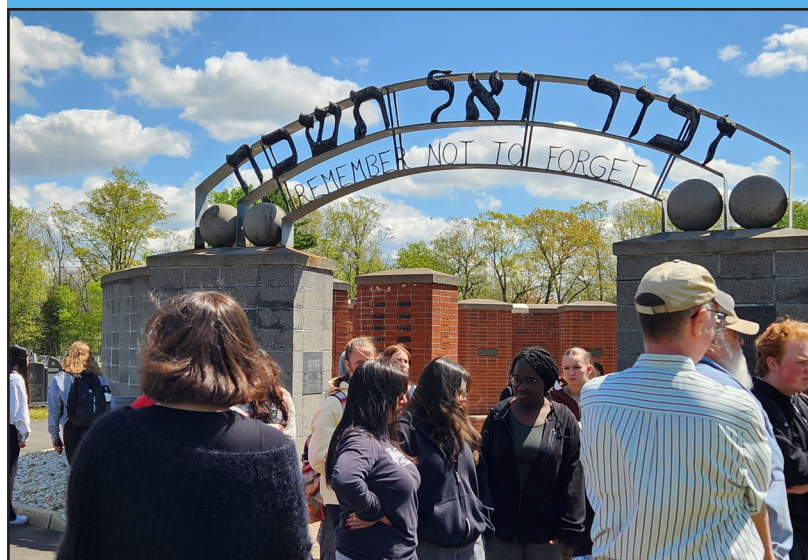
High school students from Egg Harbor City at the Holocaust Memorial at the Alliance Cemetery.