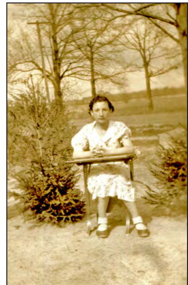
Norma Grade School 1934.