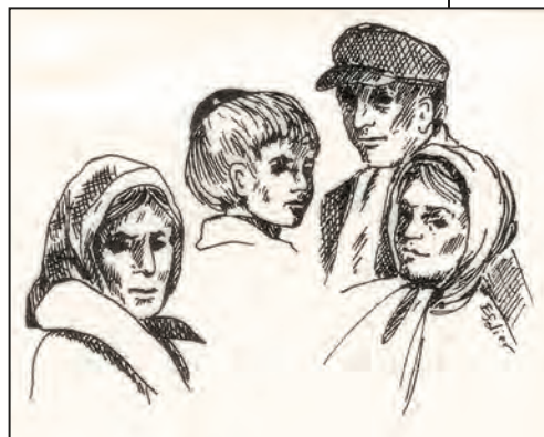
Letterhead artwork for The Alliance Colony Foundation.

The drive to preserve and tell the story of Alliance is well established. In 1932, the occasion of the first Yoval , the voices of many of the founding generation and their children remained strong. The souvenir book published at that time is a starting point for anyone interested in the day-to-day life of the early settlers. There were celebrations at 75 and 80 years and a second Yoval , which took place in 1982. By then the founding generation had departed, but their children and grandchildren, most no longer directly connected with the farming community, came together in celebration. The occasion was well documented in print and film. Renewed interest was most clearly seen in the formation of “The Alliance Colony Foundation” in order to preserve the history of the colony. Two additional large gatherings have been held: one in 2007, the 125th anniversary of the founding, and another in 2018. In addition, a Facebook group of Alliance descendants has been active since May 2017.