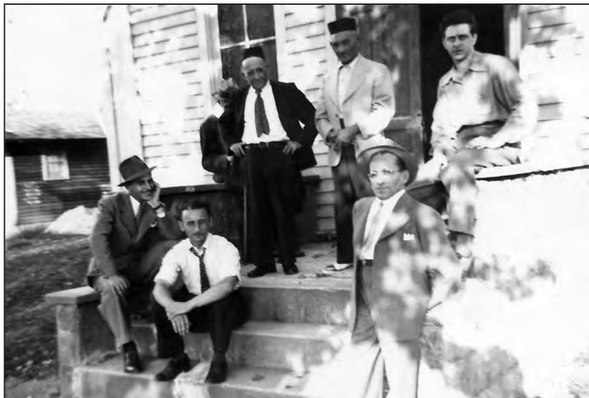
At the Brotmanville Synagogue.