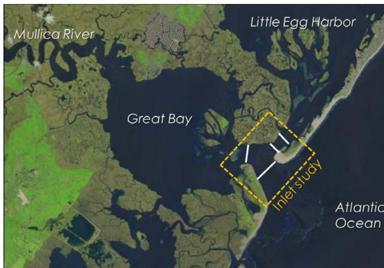
Figure 1. Map of Little Egg Inlet study area (yellow box). White lines are proposed survey transects of each branch of the inlet. During each survey, the transect lines will be repeated in a circuit for 14 hours to cover a full ebb and flood of the tide.

I have prior experience in the methods required for this study from my graduate and postdoctoral work [4]. I have access to the necessary equipment and software for data collection at Stockton, which I have used to conduct demonstration surveys with students in my MARS 3309 Coastal Oceanography course (Fig. 2). Finally, I collected preliminary data at a single fixed station in August 2017, prior to dredging activity, and received Provost Faculty Opportunity Funds to repeat the fixed station data collection in Spring 2018. However, measurements at fixed stations lack complete spatial information about water velocity, which often has high variability from one side of an inlet to another (Fig. 2).